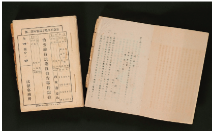
Court records from the Popular Front Incident of 1937 (Sakisaka Library)