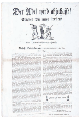
Wall news sheet from 1848 revolution in Germany