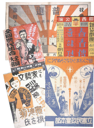
Items from the poster collection