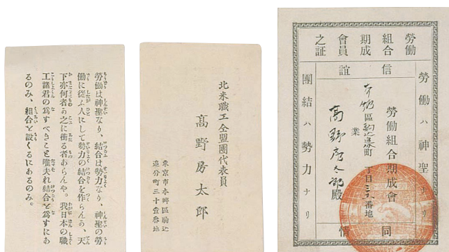
Fusatarō Takano's American Federation of Labour name card and Association for the Formation of Labor Unions member's card