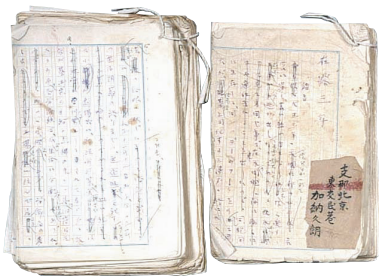
Unpublished manuscript copy by Sen Katayama of Three years in Russia (Sakisaka Library)