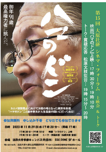
Poster of the Fifteenth OISR Cinema Forum

English website: https://oisr-org.ws.hosei.ac.jp/english/