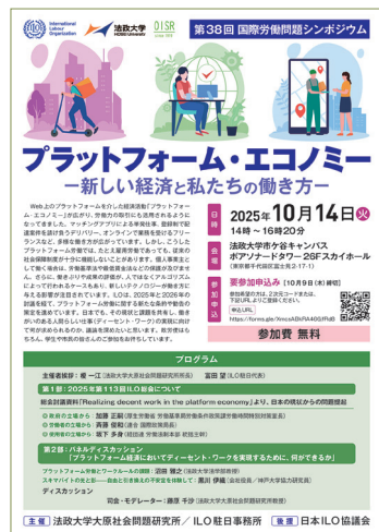
Poster of the 38th Symposium on International Labour Issues