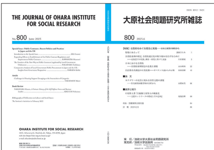
The 800 th issue of The Journal of the Ohara Institute for Social Research, published June 2025.

(2) The Journal of the Ohara Institute for Social Research ( Ōhara shakai mondai kenkyūjo zasshi ): Published monthly by Hosei University Press, the journal is one of Japan's leading peer-reviewed academic journals in the fields of labour studies, industrial relations, and other fields of social science and history. The journal accepts submissions of articles in Japanese by scholars in Japan and abroad. As of July 2025, the journal has published 801 issues.