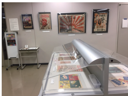
The Ohara Institute for Social Research Centennial Exhibitions, Poster Exhibition

(4) Special Exhibition: The Forerunner of Research on Social Problems: From the Establishment of the Ohara Institute for Social Research to its Merger with Hosei University (From October 1 to October 20, 2019, held at the exhibition room in Boissonade Tower on Hosei University Ichigaya Campus).